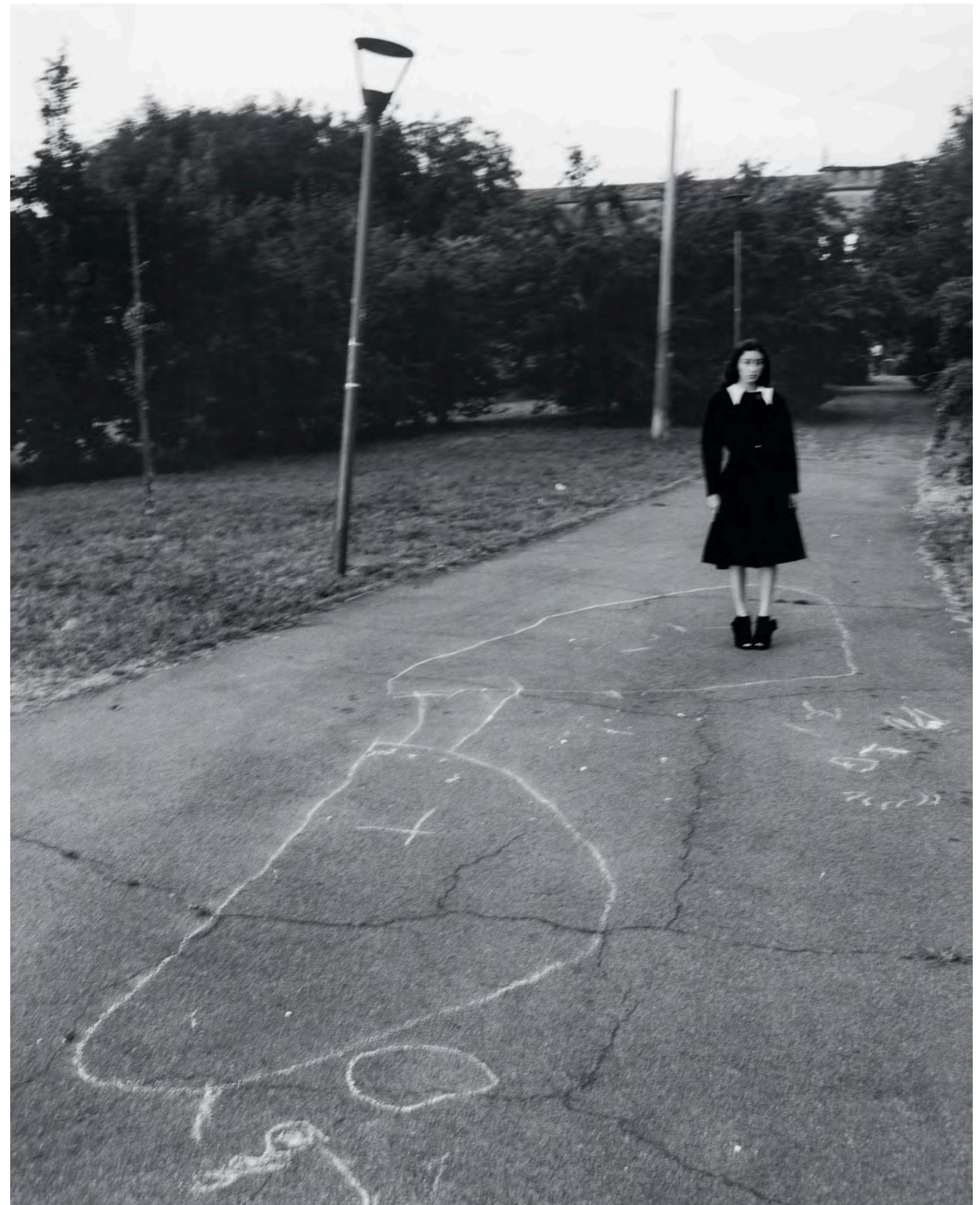
Anita is wearing a wool crepe coat with contrasting collar and suede boots by MIU MIU, Autumn/Winter 2011

Styling KATIE SHILLINGFORD