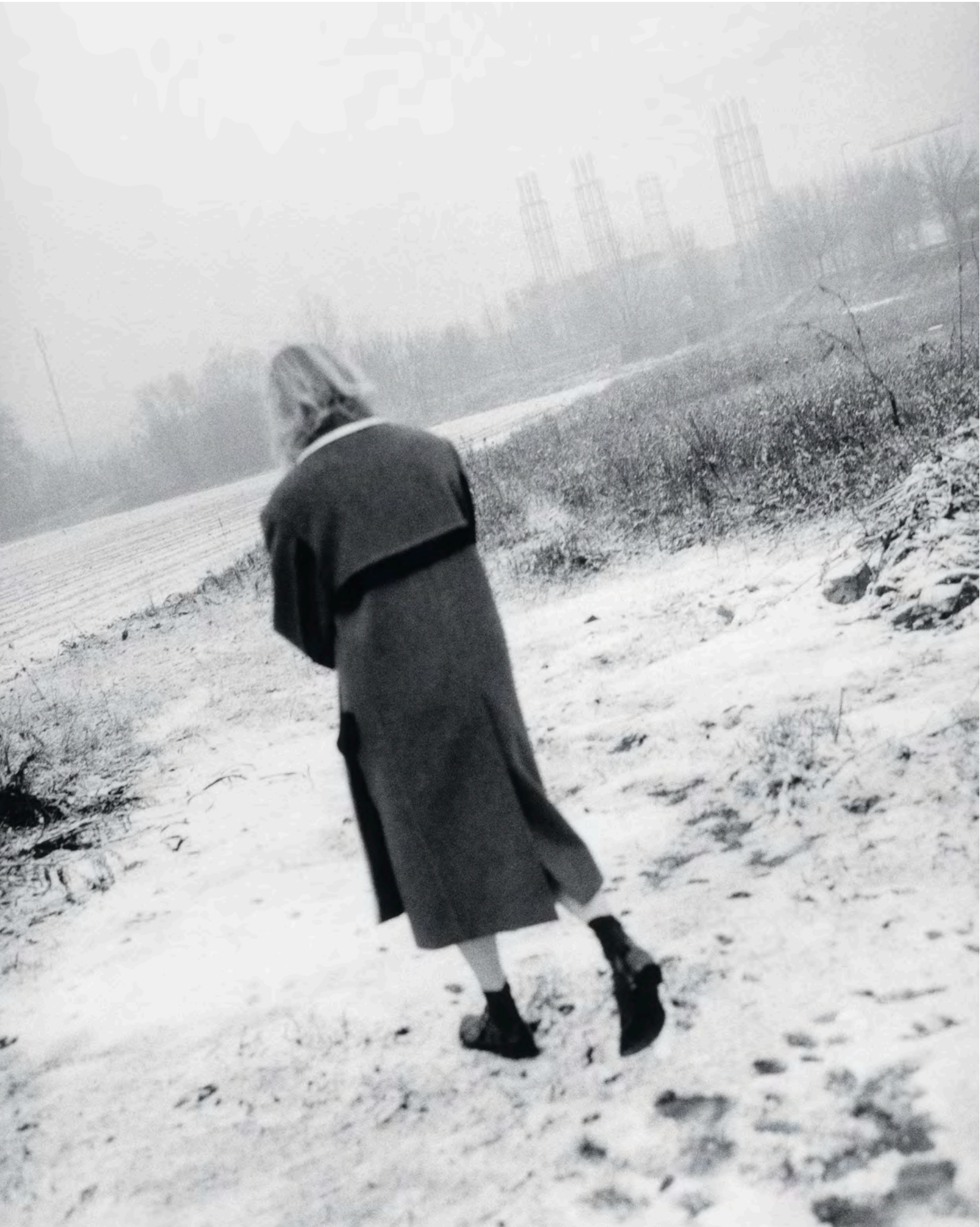
Opposite page: Anita is wearing a satin and crocheted dress and faux-fur boots by MIU MIU, Autumn/Winter 2021